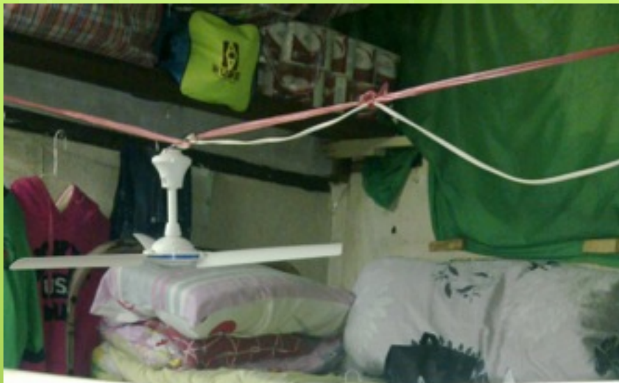
Electric fans and installation dangling everywhere