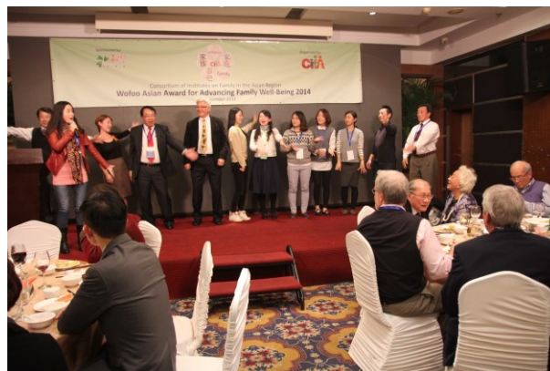
Participants' wonderful performance at the Gala Dinner

Apart from the Scientific Program, the participants had ample opportunities to network and exchange during the tea breaks, lunches, Welcome Reception and the Gala Dinner when participants enjoyed delicious food and wonderful performance by the participants of the Symposium. The climax of the evening was the Award Presentation Ceremony of the Wofoo 3A Project 2014 which was exciting and filled with joy and applause.