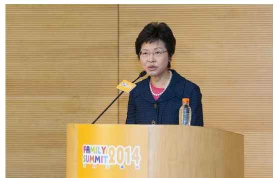
Mrs. Carrie Lam, Acting Chief Executive delivering the keynote speech at the Opening Ceremony

8 concurrent sessions on various topics, including Financial Education for Families, Post-separation and Co-parenting, Family play and reading through community partnership, Parent Education in School Setting, What media can do in building family resilience, Adopting Positive Psychology, Cross Generational Solidarity and Positive Care-giving and Smart Use of IT in Facilitating Family Cohesion have been delivered, generating a lot of discussion and exchange. This is the first time that so many