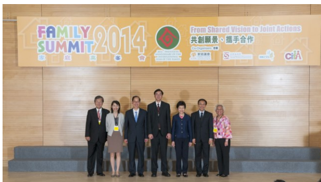
Group photo of representatives of co-organizer at the Opening Ceremony

The Acting Chief Executive, Mrs. Carrie Lam was the Guest of Honor who delivered a keynote on “Reflection on Policy, Development and Practices for Families in Hong Kong”. It was followed by 4 plenary sessions, covering a wide range of topics including Insights from Findings of Family Survey 2013 in Hong Kong, Family Impact Assessment Framework, Singapore experience in Building a Family Friendly Society and Cross Sector Efforts in Building a Family Friendly Society in Community Health, Food and Nutrition, Living and Environment, Travel and Leisure.