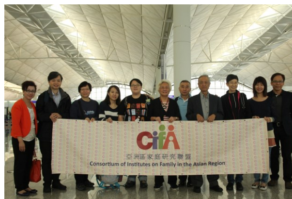
Group photo of Hong Kong delegation at the Hong Kong International Airport

The Wofoo 3A Project 2014 received a total of 39 entries from social service units of government and non-governmental organizations, as well as tertiary institute from various parts of the region. Having gone through the process of vetting these projects, 16 had been short-listed to enter into the second round. After the Interview Session held on 28 and 29 July 2014, 8 of the 16 shortlisted teams were chosen to enter into the Final Round Adjudication held on 14 th November 2014 at the 4 th CIFA Regional Symposium in Shanghai, China to compete for the Gold, Silver and Bronze, My Favorite Project Award and the Best IYF Project Award, followed by the Award Presentation Ceremony.