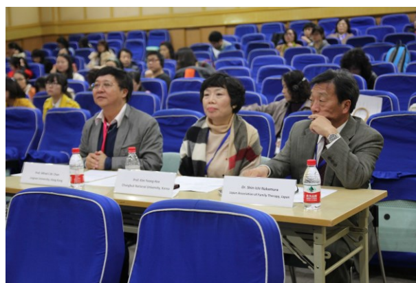
Adjudication panel at the Final Round Adjudication

To sustain the momentum and synergy created so far, another opportunity for sharing will be provided in Hong Kong on 11 June, 2015 at the Chinese University of Hong Kong with sponsorship from the Family Council. Finalist teams, together with winning teams of 3A Project 2012, will present their projects and share how they have furthered their work with the families. Agency visits will be organized on 12 June 2015 to provide opportunities for participants to see services in action and to have direct dialogue with front line professionals. In doing this, the 3A Project is achieving its objectives of sharing of experience and practice wisdom, and once again echo the theme of “Aspiration for Sustainability, Innovation & Applicability”.