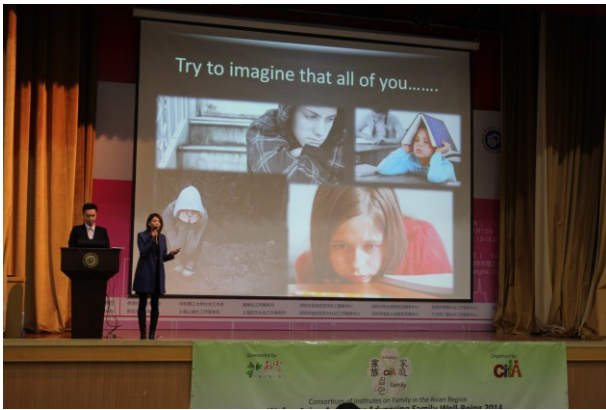
Finalist team presenting their project at the Final Round Adjudication