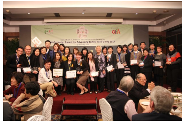
Group photo of the finalist teams at the Award Presentation