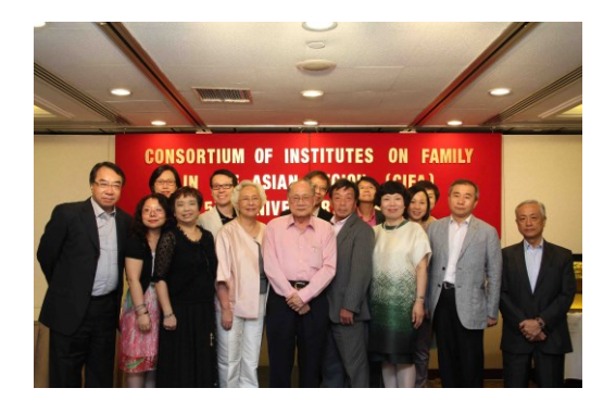
Group photo of local and overseas members