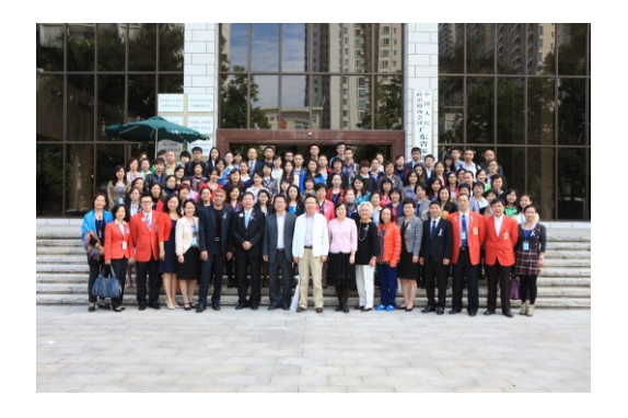
Group photo of organizers, speakers and participants

Indeed, the Forum had strengthened the professional exchange on family practices and cooperation among CIFA member organizations.