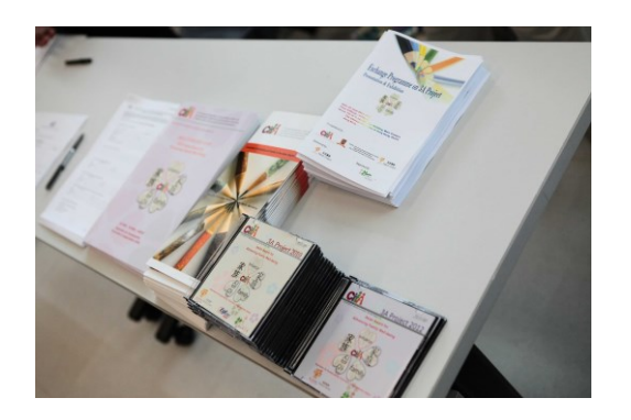
3A Project 2012 Brochure and DVD