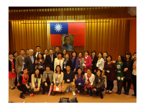
Group photo of speakers and participants

A two-day agency visit was also arranged by the organizer for 26 social workers from China. This visit was well organized and the participants valued this opportunity of learning and exchange. This has demonstrated the spirit of creating platform for professional exchange as upheld by CIFA.