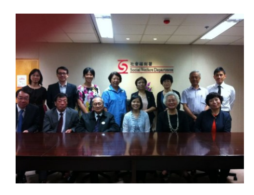
Group photo at Social Welfare Department

All those involved found the visits to be fruitful in fulfilling its purposes, and provided a very good opportunity to strengthen the linkage between concerned parties and provided a platform to explore possibilities for future collaboration, especially in the run up to 2014, the 20<sup>th</sup> Anniversary of the International Year of the Family. It also laid a good foundation for future cooperation.