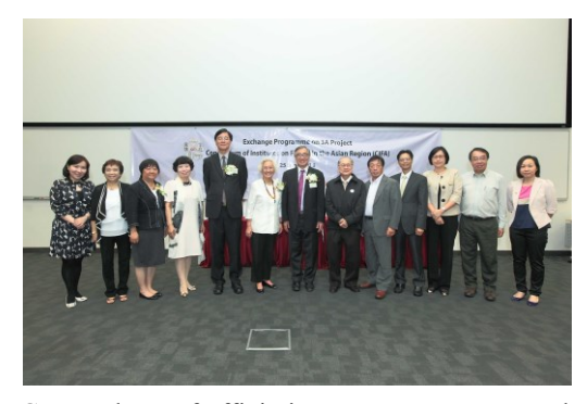
Group photo of officiating guests, sponsors and co-organizers, and Council members