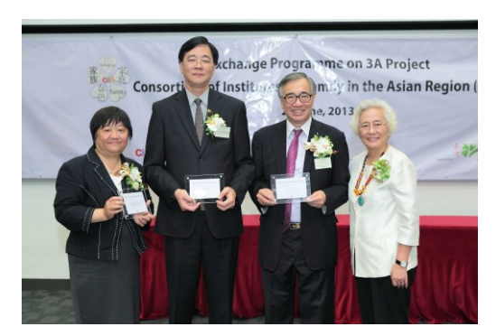
Souvenir presentation to sponsors and co-organizers

Around 160 participants from various quarters attended the Sharing Session when 6 of the 2012 teams presented their projects and the three 2010 award winning teams reported on the progress made in the past two years. The presentations were followed by Open Forums, generating a lot of discussion and reflections among the participants.